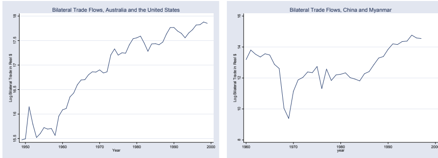
Figure 1: Trade flows between both democratic and both nondemocratic trading pairs.

binary indicators for trade pairs in which both countries are democracies and for trade pairs in which only one is a democracy, as summarized by the upper specification in (2); ( B2 ) The same regression as ( B3 ), but with quadratic terms for both log GDP and log GDP per capita; ( B3 ) The regression in (1) with the continuous measure of democracy, as given in the lower specification of (2); ( B4 ) The same regression as ( B3 ), but with quadratic terms for both log GDP and log GDP per capita.